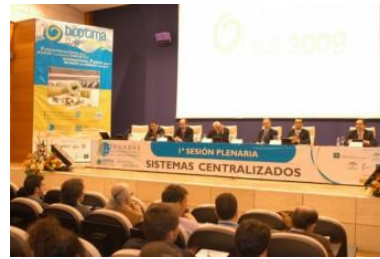
BIOPTIMA 2010 Edition